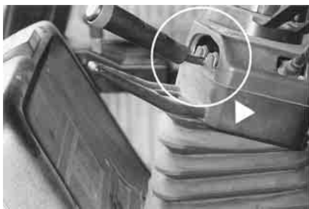
Here the lever is in the notched neutral position.