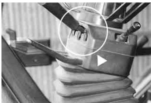
Here the control lever has remained balanced on top of one of the high point bearings between the notches.