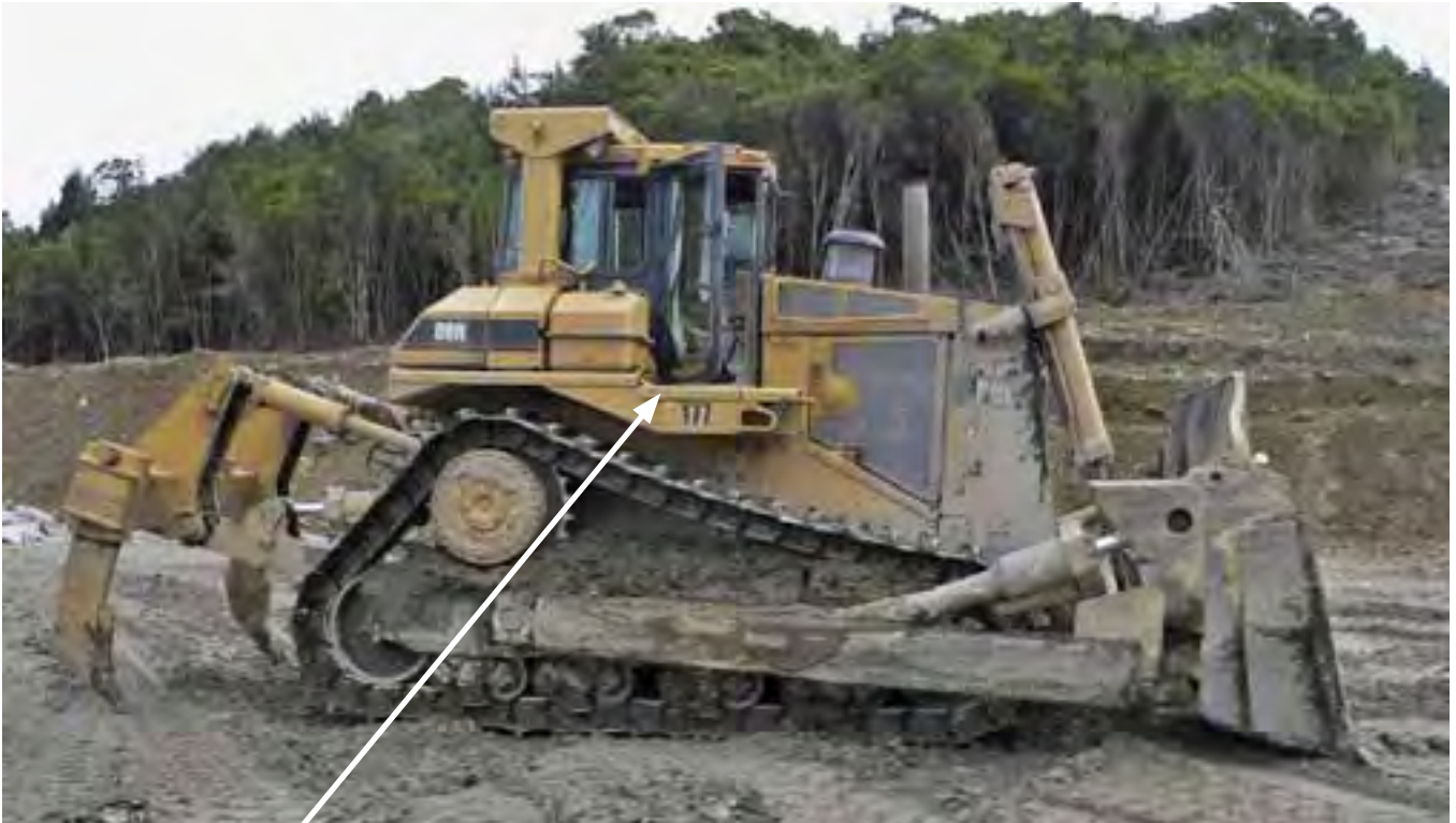
Arrow indicates the platform the operator fell from