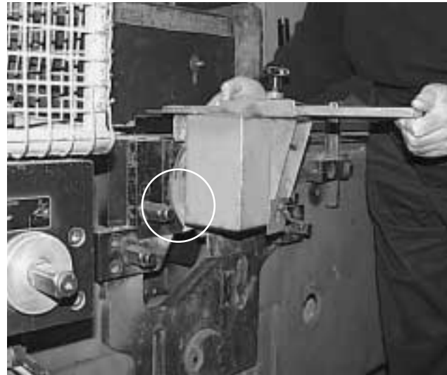
The cutter bearing cover plate is opened with a lift and turn motion

Note: the positive locking tongue welded to the cover plate